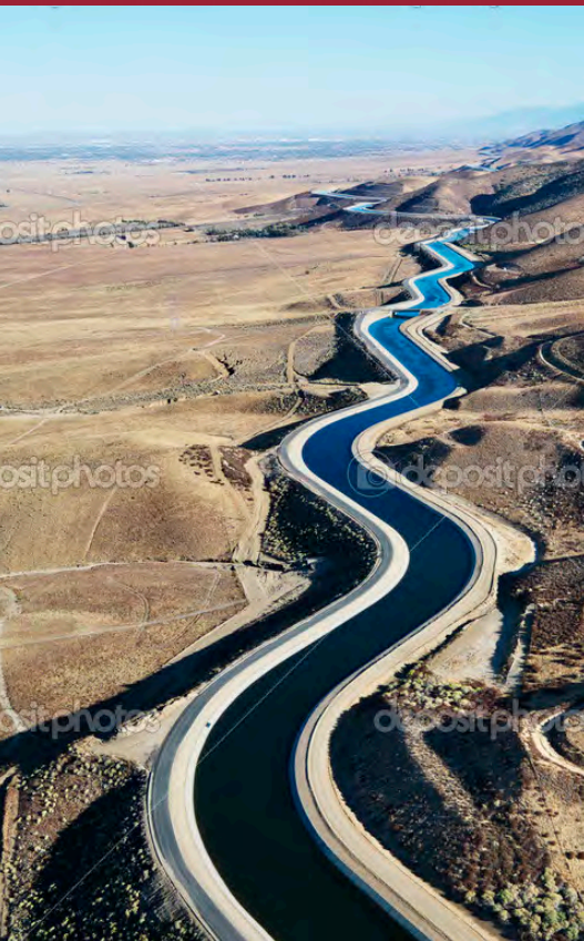
Aerial view of water carrying aqueduct in Outer Los Angeles, California.

MAN NEED NOT FEEL GUILTY, BECAUSE HIS BASIS